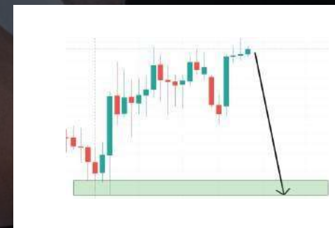
Trend Reversal Strategy