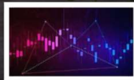
Volume Spread Analysis