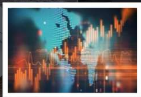
Trend Trading Strategy